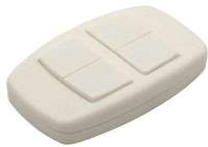
TLD-WHC Dual zone Remote Control