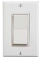
TLD-WDC Single zone Wall Control