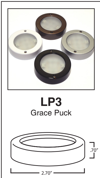
LP3 Grace Puck